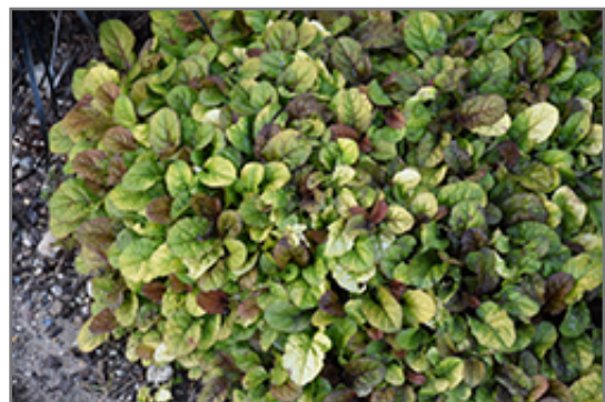
Feathered Friends Parrot Paradise Bugleweed