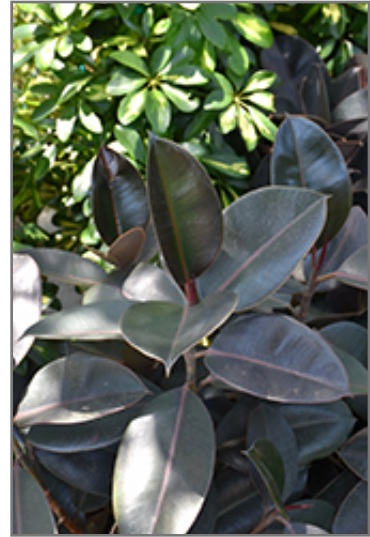
Burgundy Bush Rubber Plant foliage

When grown indoors, Burgundy Bush Rubber Plant can be expected to grow to be about 8 feet tall at maturity, with a spread of 6 feet. It grows at a medium rate, and under ideal conditions can be expected to live for approximately 50 years. This houseplant will do well in a location that gets either direct or indirect sunlight, although it will usually require a more brightly-lit environment than what artificial indoor lighting alone can provide. It prefers dry to average moisture levels with very well-drained soil, and may die if left in standing water for any length of time. This plant should be watered when the surface of the soil gets dry, and will need watering approximately once each week. Be aware that your particular watering schedule may vary depending on its location in the room, the pot size, plant size and other conditions; if in doubt, ask one of our experts in the store for advice. It is not particular as to soil type or pH; an average potting soil should work just fine.