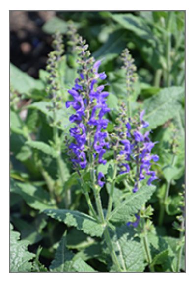
Color Spires Indiglo Girl Sage flowers