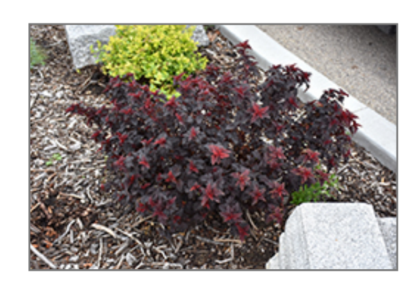
Fireside Ninebark

Fireside Ninebark is recommended for the following landscape applications;