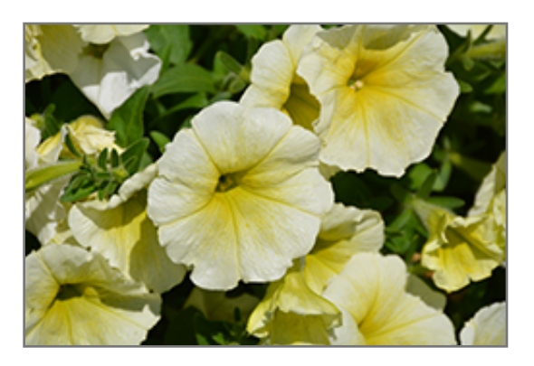
Easy Wave Yellow Petunia flowers

Easy Wave Yellow Petunia is recommended for the following landscape applications;