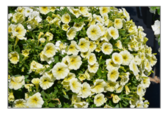
Easy Wave Yellow Petunia flowers