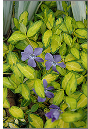
Illumination Periwinkle flowers

Illumination Periwinkle is recommended for the following landscape applications;