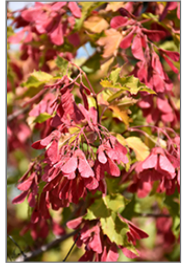
Amur Maple (tree form) fruit

This tree does best in full sun to partial shade. It is very adaptable to both dry and moist locations, and should do just fine under average home landscape conditions. It is not particular as to soil type or pH. It is highly tolerant of urban pollution and will even thrive in inner city environments. This is a selected variety of a species not originally from North America.