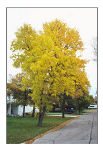
Green Ash in fall