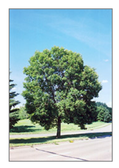
Green Ash