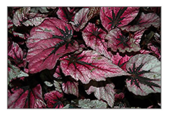
Shadow King Pink Begonia foliage

Shadow King Pink Begonia is recommended for the following landscape applications;