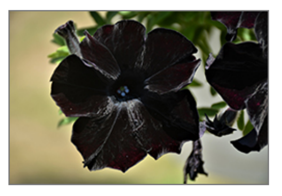
Crazytunia Black Mamba Petunia flowers

Crazytunia Black Mamba Petunia is recommended for the following landscape applications;