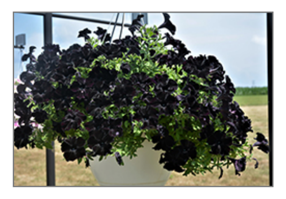
Crazytunia Black Mamba Petunia in bloom