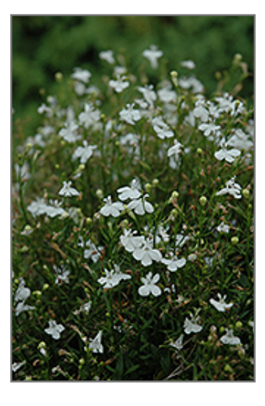
Waterfall White Sparkle Lobelia flowers