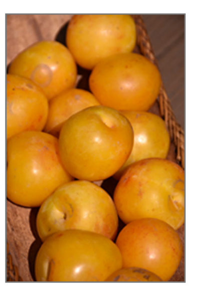
Brookgold Plum fruit